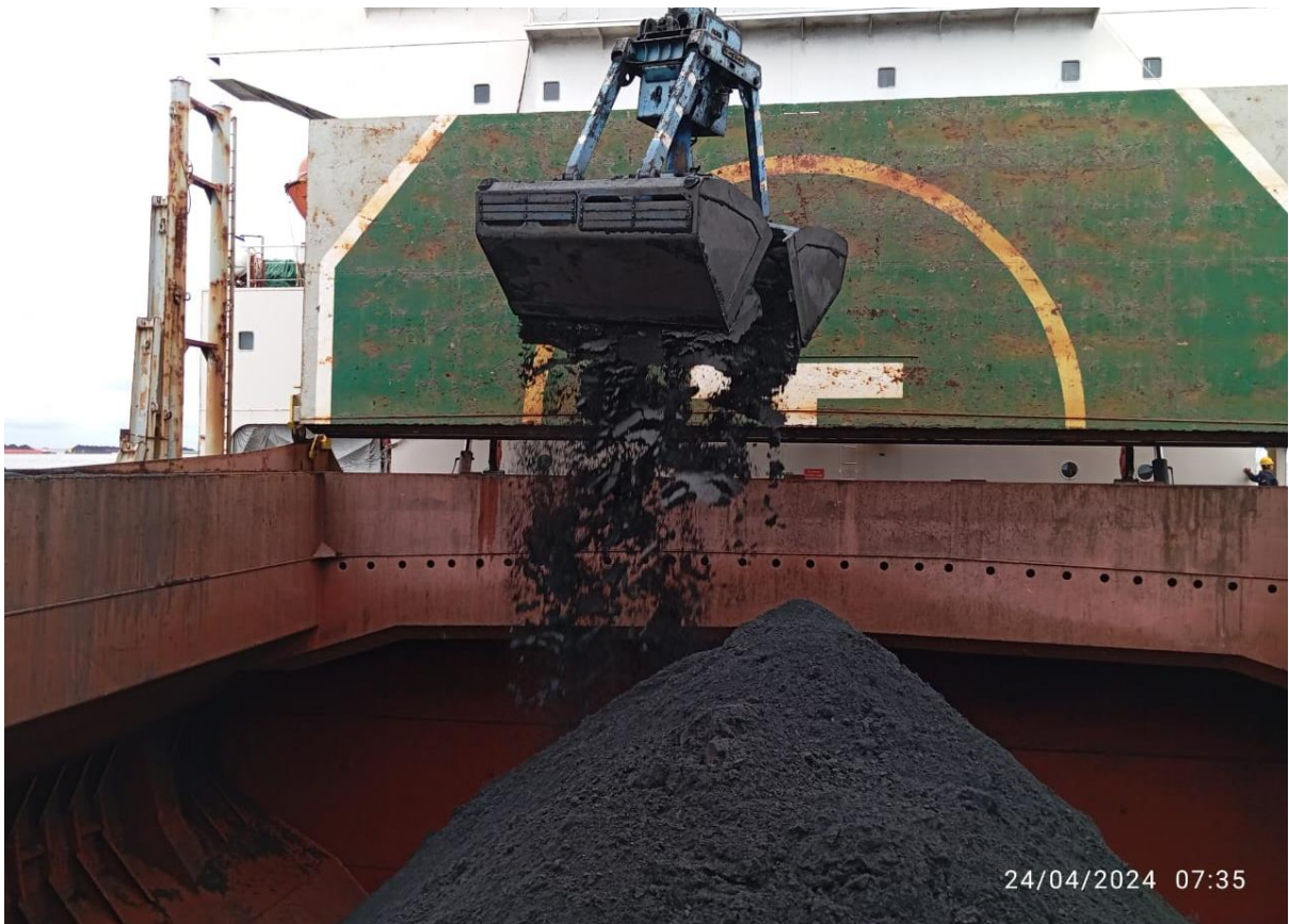
Unloading of coking coal from Cokal's barges to Mother Vessel at Taboneo Anchorage